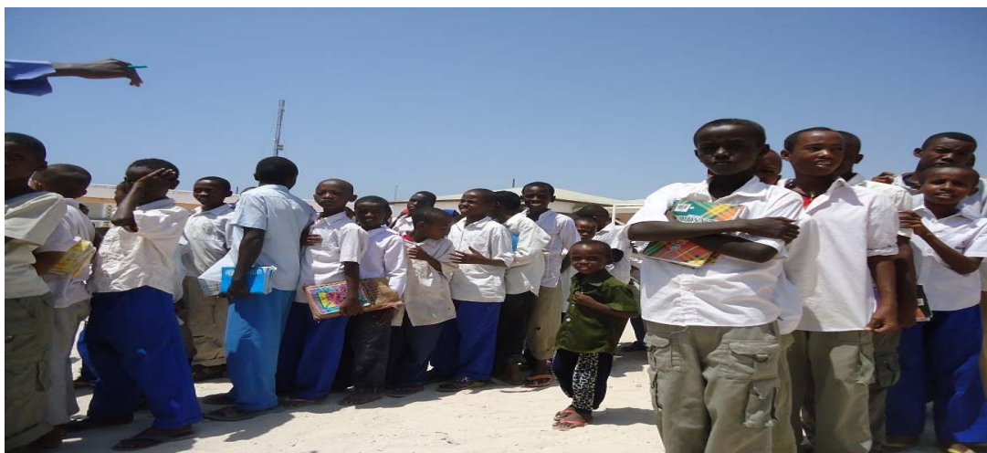
Mohamud Mire school students preparing for class

Department of School Facilities and Educational Infrastructure