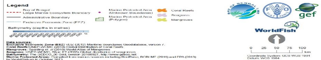
Figure 2.1 Protected Areas of the Maldives